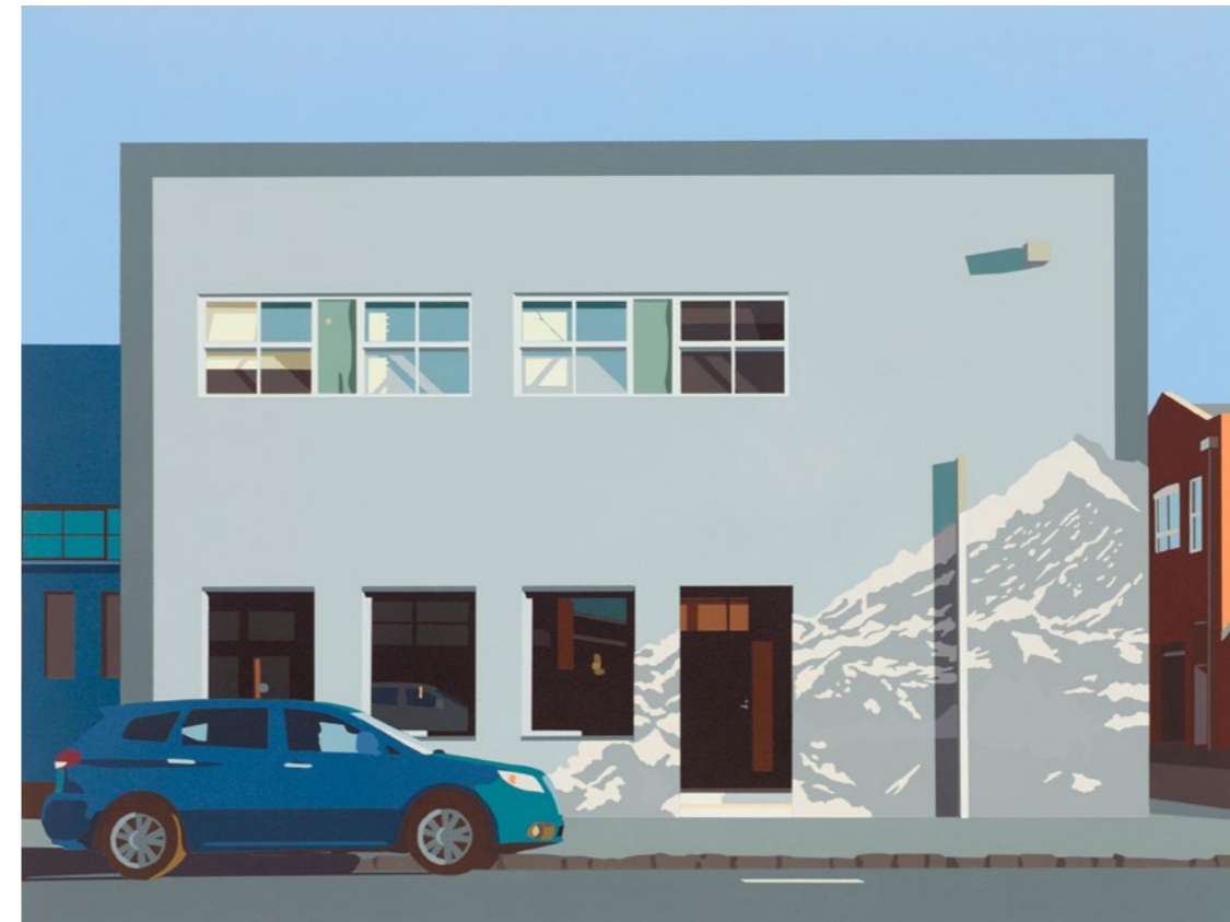
All works acrylic on board unless stated otherwise. Clockwise from top left: Industrial Streetscape 02 2019 Acrylic on super fine polyester 152 x 122cm, Airport 2019 46 x 61cm, Underground 2019 46 x 61cm, Industrial Streetscape (study) 2019 46 x 61cm, Petrol Station 02 2020 Acrylic on super fine polyester 122 x 152cm, Petrol Station 2019 46 x 61cm, House 2019 46 x 61cm, Field and Tree 2019 46 x 61cm, Girl and Cat 2019 40.5 x 30.5cm, Boy and Cat 2019 40.5 x 30.5cm.